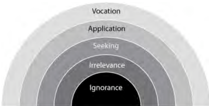
Figure 1: Vocational Scope

Our model (here, it is similar to other business and faith integration models) suggests stages of Christian vocation (see Figure 1). The stages are represented as arcs rather than stairs or points along a line to soften the visual suggestion of a linear progression; the broader the arc, the more expansive and inclusive the vocational expression. Each arc adds a dimension