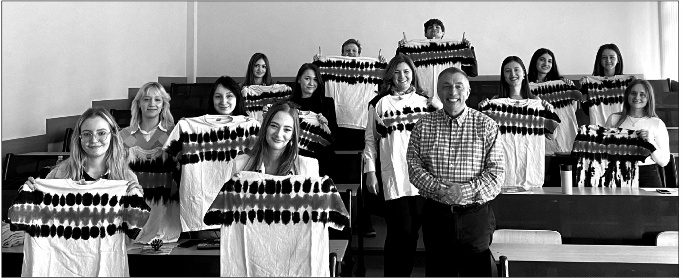
Figure 4: Final Day of Class at the Academy of Economic Studies of Moldova

who I am and simultaneously broadened my perspective of the world. Clearly, living in another country for a prolonged period of time has changed me far more than I have changed any of my destinations. Change may not be the best word here. I find myself limited by my English vocabulary. Living in Chisinau and Bucharest has clarified who I am and who I am not, what I can do and what I cannot do.