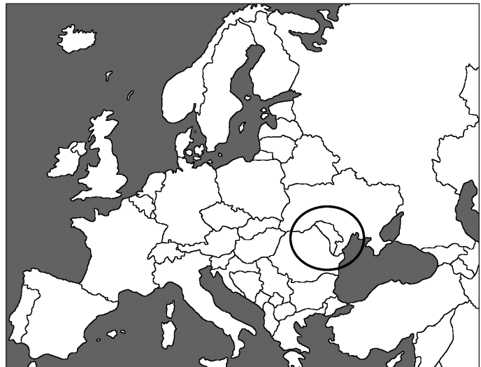
Figure 1: Location of Moldova

The Roman Empire reached its peak at the beginning of the second century. At that time, the land that makes up modern day Moldova and Romania was named Dacia. Dacia was a part of the Roman Empire from about 100 to 275 AD, and one of the lasting influences of the Roman Empire on Moldova is the Romanian language. Moldova was a vassal state in the Ottoman empire from 1538 to 1812. To the extent that Moldova was relatively independent during that period, there are not a lot of noticeable historic Turkish influences in modern day Moldova with the exception of the stone Bender Fortress, which was constructed by the Ottomans. In addition to Romanian, most Moldovans also speak Russian. Moldova was a part of the Russian Empire from 1812 to 1918 and a part of the Soviet Union from 1940 to 1991.